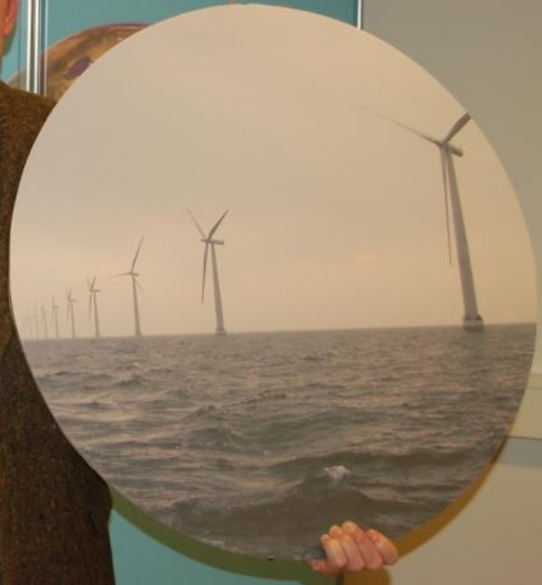
The Ideas Bank Model: Best practices - new dialogues - futurepictures